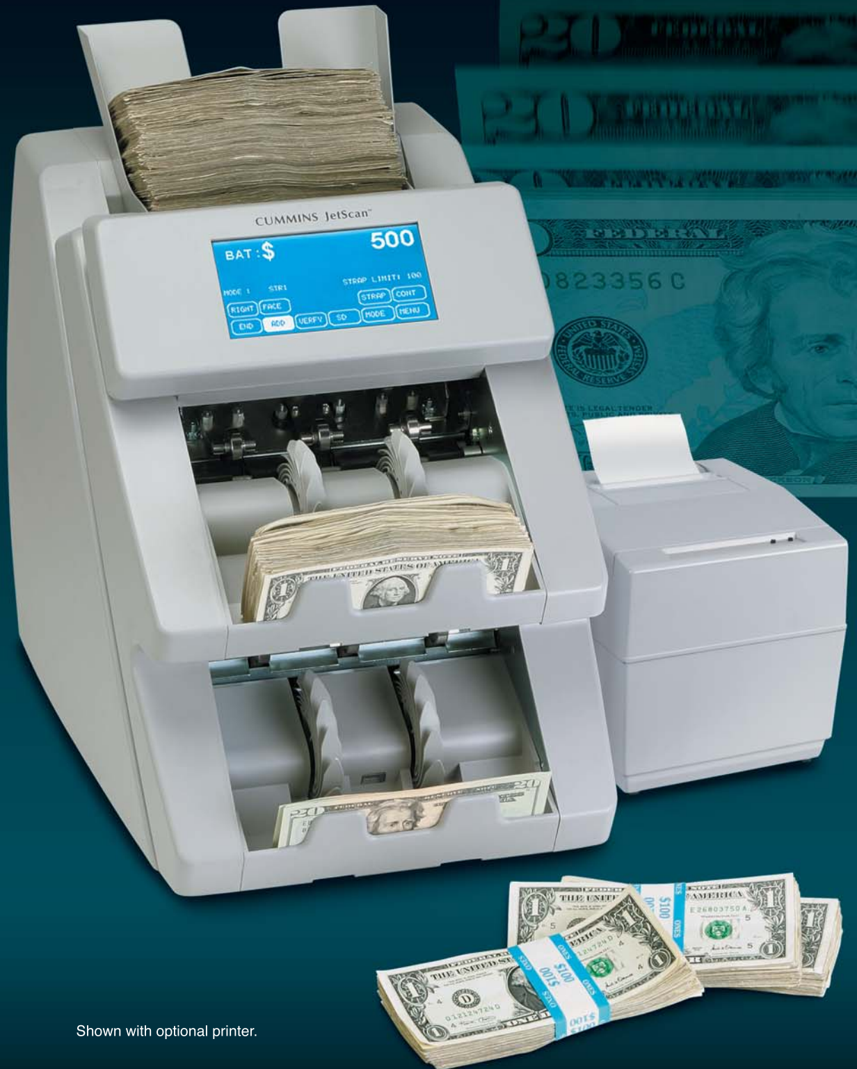
Shown with optional printer.