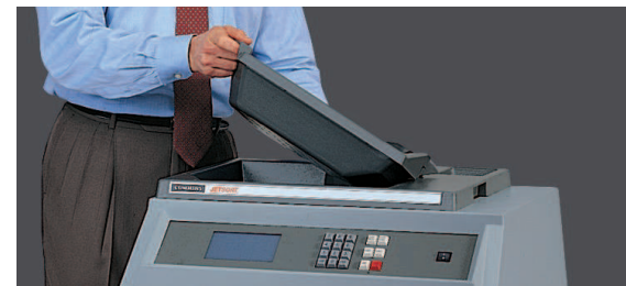
Optional large capacity lift tray pours coins quickly and neatly into sorter.