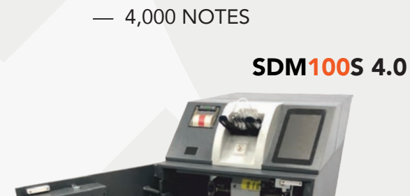
CANVAS BAG FREE FALL