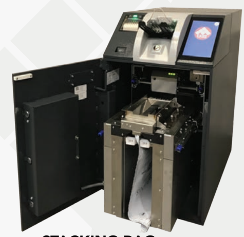
STACKING BAG — 1,500 NOTES