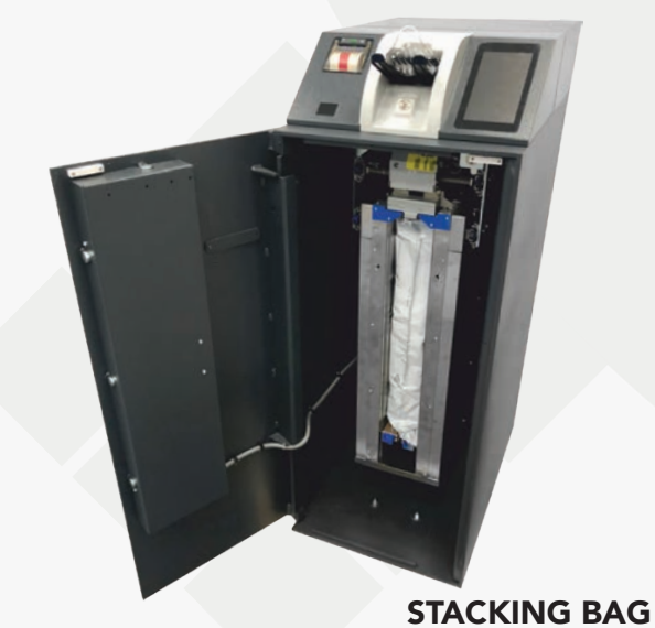
— 4,000 NOTES